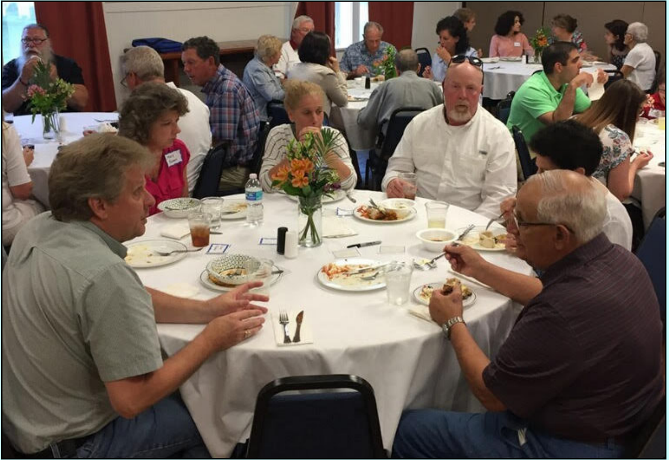
RCIA RECEPTION APRIL 14, 2018